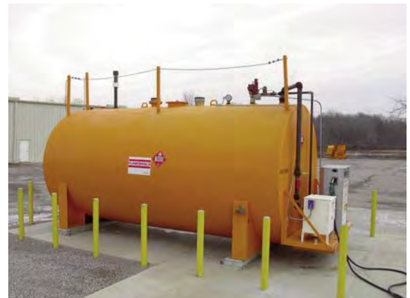
Compatible with a wide range of fuels and chemicals, including biodiesel and ethanol