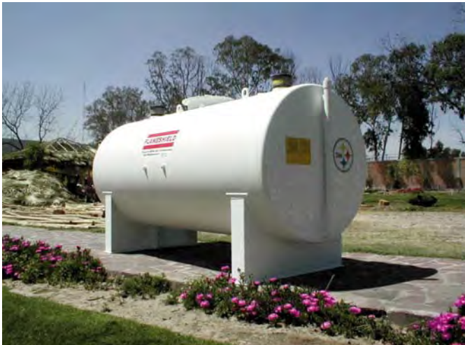
2-Hour 2000° fire-tested performance

FLAMESHIELD® aboveground storage tanks are manufactured with a tight-wrap double-wall design. Standard features include 2-hour fire-tested performance, built-in secondary containment and interstitial monitoring capability.