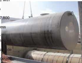
AquaSweep™ Installation at Chicago's O'Hare International